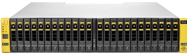
HPE 3PAR StoreServ 8000 Storage (2-Node Storage Base)

HPE 3PAR StoreServ 8000 is storage made effortless.