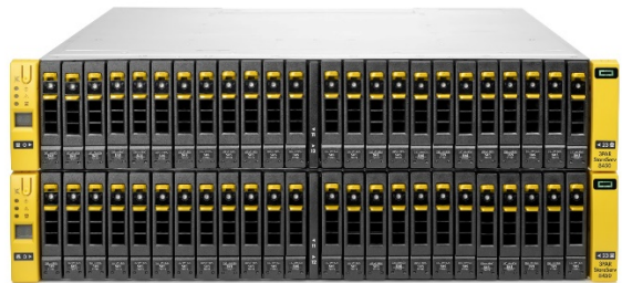
HPE 3PAR StoreServ 8000 Storage (4-Node Storage Base)